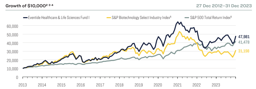
This is a hypothetical illustration and is not intended to reflect the actual performance of any particular account. Future performance cannot be guaranteed and investment returns will fluctuate with market conditions.

The Eventide Healthcare & Life Sciences Fund seeks to provide long-term capital appreciation by investing in securities of healthcare and life sciences companies. The Fund invests in companies that we believe demonstrate values and business practices that are ethical, sustainable, and provide an attractive investment opportunity. The Fund also invests in securities with significant near-term appreciation potential. Under normal market conditions, the Fund will invest at least 80 percent of its net assets in equity and equity-related securities of companies in the healthcare and life sciences sectors.